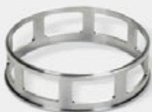
Impact bar for gentle comminution

The FRITSCH impact bar is the ideal solution for very gentle grinding of especially heat-sensitive materials such as powder coatings or plastics as well as for the smooth pre-crushing and fine comminution of hard-brittle to soft, fatty or samples with residual moisture. The impact bar acts as a stator on which the material is additionally beaten. The result: increased grinding performance for a particularly fast and efficient grinding that minimises the thermal load. The corresponding impact rotor and a special sieve ring for the impact bar must be ordered separately.