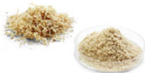
Optimal preparation of a wood sample with the cutting rotor

Turn your PULVERISETTE 14 premium line into a Cutting Mill with just a few simple motions for fast, efficient pre-grinding of fibrous materials and plastics: Simply insert the cutting rotor with cooling fins with the appropriate accessories such as the collecting vessel, labyrinth disk and sieve ring – the materials are ground by cutting and shearing forces. The PULVERISETTE 14 premium line will detect the labyrinth disk and automatically operate in an optimised mode as a Cutting Mill with up to 10,000 rpm. The desired final fineness will also be determined here by the selected sieve ring with trapezoidal or round perforation. And the use of a FRITSCH Cyclone separator will further improve throughput and cooling.